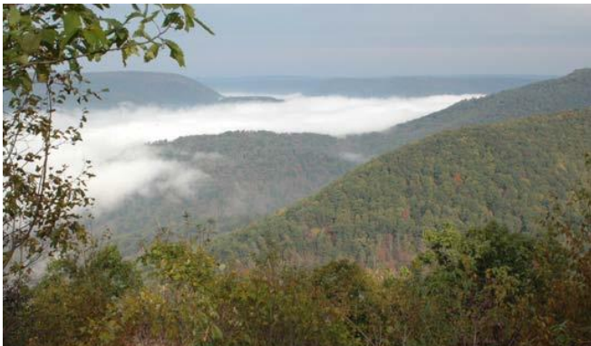
Forest landscape along the West Branch Susquehanna River, Clinton County.

Within a few weeks during the summer of 2000, eight towers rose two hundred feet above an agricultural field on a low ridge top along the Pennsylvania Turnpike. Not long after, large blades began sweeping the Somerset County sky as Pennsylvania's first industrial wind facility went on line. Several years later and an hour drive to the west, an unusual natural gas well was drilled over a mile down and pumped full of water. That well in Washington County yielded a surprising amount of gas flowing from fractures in a shale formation that geologists had long suspected held plenty of gas but has been too expensive to develop. Meanwhile, a Canadian company bought a small sawmill in Mifflintown and started producing wood pellets for stoves, boilers, and electric plants. It soon