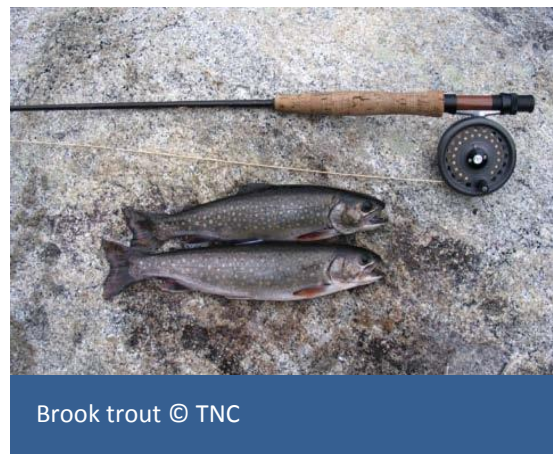
Brook trout

Freshwater. Aquatic habitats are at risk too. Once widespread, healthy populations of native eastern brook trout in Pennsylvania are now largely confined to small mountain watersheds. Nearly 80 percent of the state’s most intact brook trout watersheds could see at least some Marcellus gas and wind development during the next twenty years. Strongholds for brook trout are concentrated in north central Pennsylvania, where Marcellus development is projected to be relatively intensive in over half of the state’s best brook trout watersheds. Exceptional Value streams – the Department of Environmental Protection’s highest quality designation – could see hundreds of well pads (perhaps 300 -750) and dozens of wind turbines (perhaps 50 – 200) located within one-half mile under the projections. Because many intact brook trout and EV streams are in steep terrain, rigorous sediment controls, and possibly additional setback measures, are needed to help conserve these sensitive habitats.