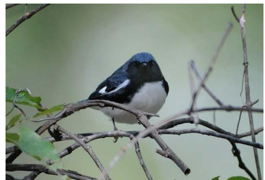
Black throated blue warblers and other interior forest species could be impacted by forest fragmentation caused by energy development.

Each of these energy sources carries both promise and risk for people and nature. The promise is that wind, natural gas, and wood biomass energy can reduce greenhouse gas emissions, generate jobs, and increase energy security. The risk is that extensive land use change and loss of natural habitats could accompany new energy development and transmission lines. Impacts to priority conservation habitats across the state have been modest thus far. For example, aerial photo analysis indicates Marcellus gas development has so far cleared just 3,500 acres of forest (about 1,000 acres for wind turbines). An additional 8,500 acres of forest is now within 300 feet of new fragmenting edges created by well pads, and associated roads and infrastructure (5,000 acres for wind turbines). This fragmentation deprives "interior" forest species, such as black-throated blue warblers, northern goshawks, salamanders, and many woodland flowers, of the shade, humidity and tree canopy protection that only deep forest environments can provide.